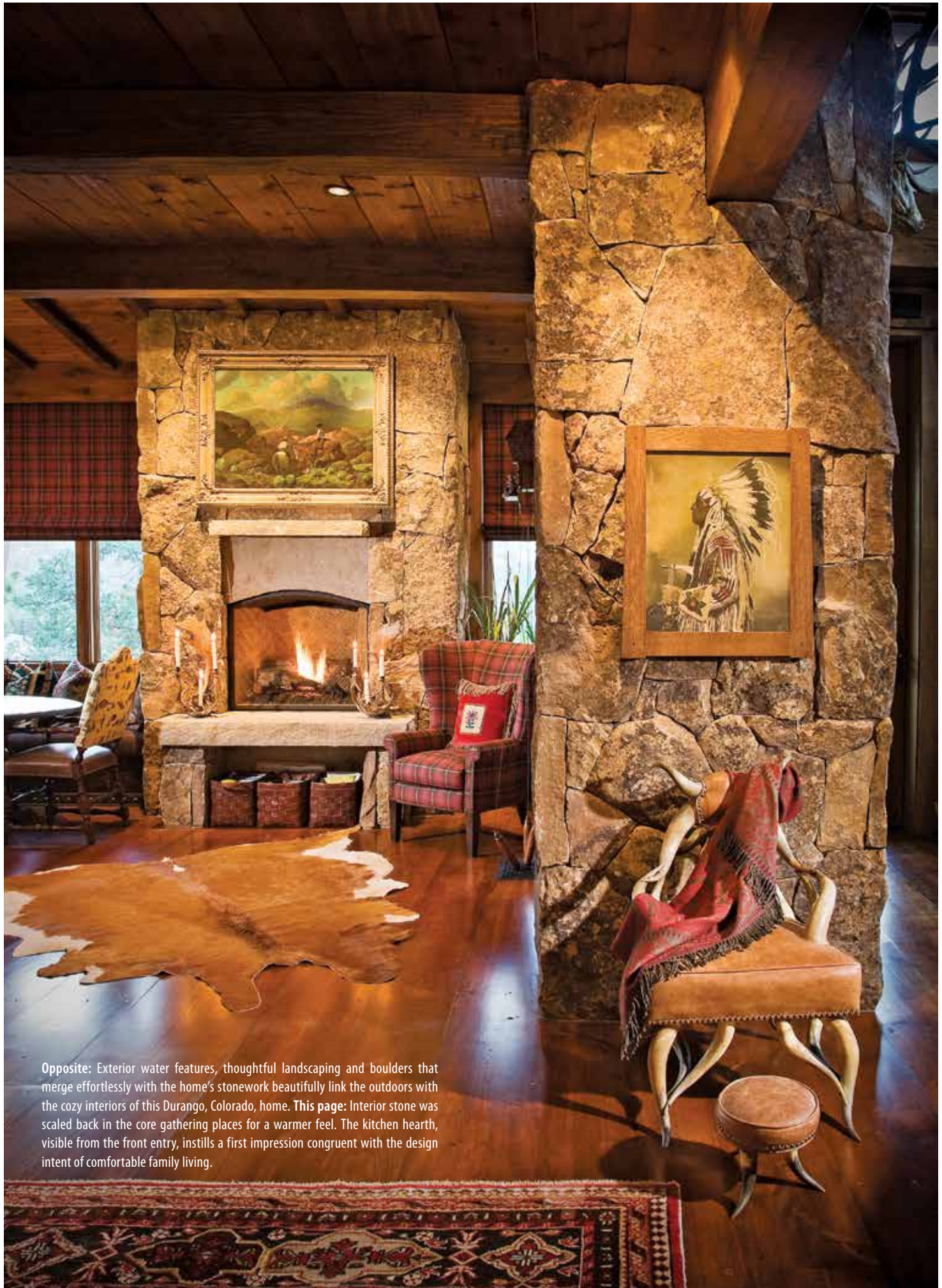
Opposite: Exterior water features, thoughtful landscaping and boulders that merge effortlessly with the home's stonework beautifully link the outdoors with the cozy interiors of this Durango, Colorado, home. This page: Interior stone was scaled back in the core gathering places for a warmer feel. The kitchen hearth, visible from the front entry, instills a first impression congruent with the design intent of comfortable family living.